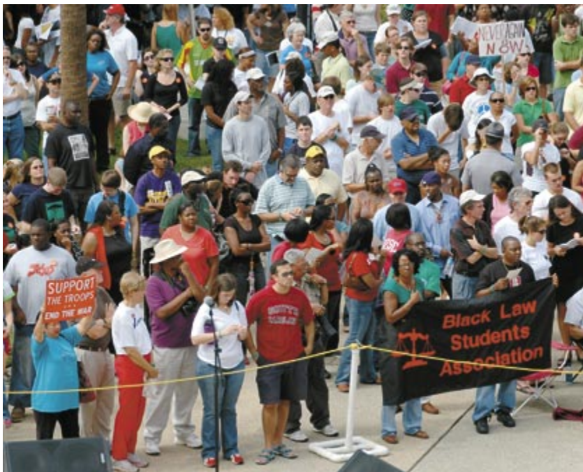
Picture from the Darfur Rally, showing the BLSA banner.